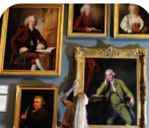
Joseph Wright Gallery, Derby