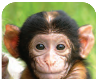
Trentham Gardens Monkey Forest