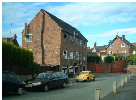
11.3.1 Georgian Crystal's premises (The Silk Mill)