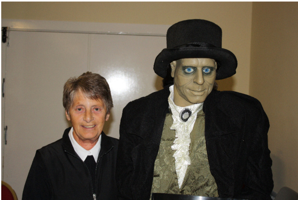
Tutbury WI President with "new friend" (right)

On Thursday night, our president made a new friend. He seemed very taken with her, but I think she was a bit nervous of him!